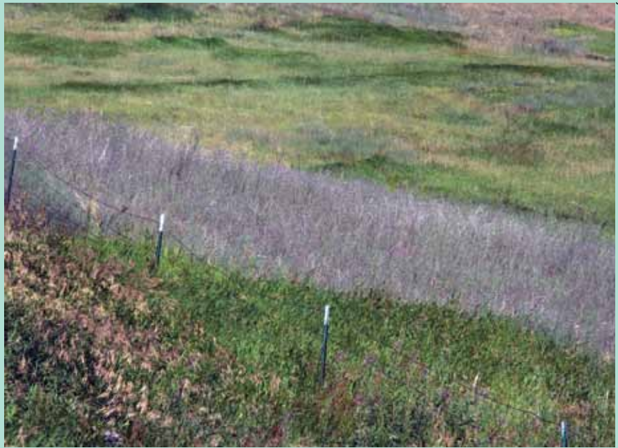
What will Greater Yellowstone area rangelands look like in future climate scenarios?